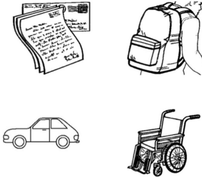
Figure 1 Example Picture Display. The sentences belonging to this display were: Mary reads a letter and Mary steals a letter.